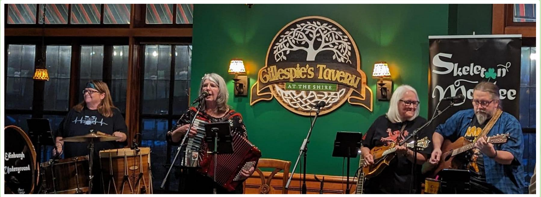
Gillespie's Tavern on the Shire, Richardson, TX