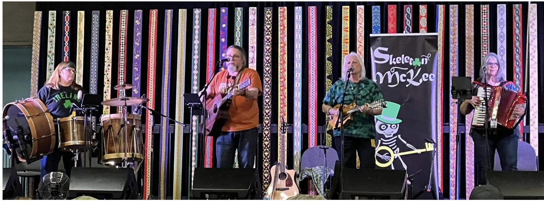
North Texas Irish Festival, Fair Park, Dallas - Trinity Stage