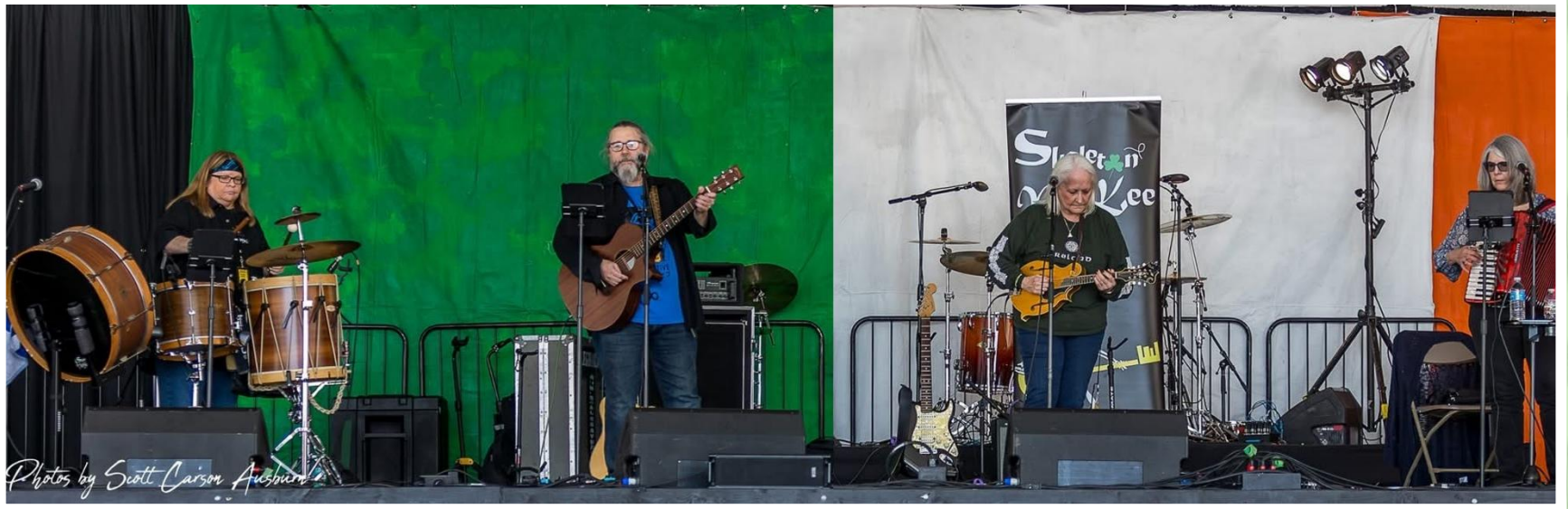
North Texas Irish Festival, Fair Park, Dallas - Shannon Stage